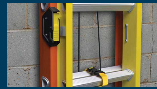
Lift assist technology reduces strain