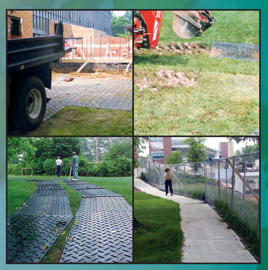
The mats preferred by professionals worldwide

The Original drive-on, ground protection mats