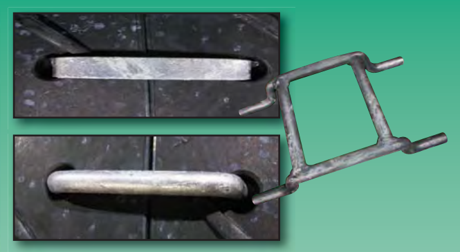
The same steel material, but with a galvanized coating: easier to locate & harder to rust.