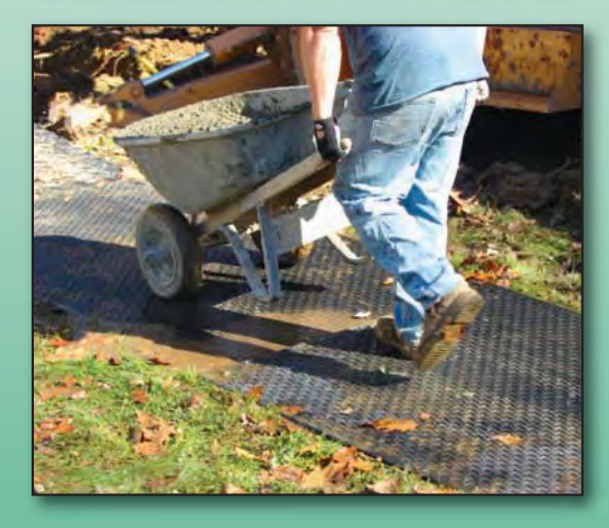
Sizes to meet your needs