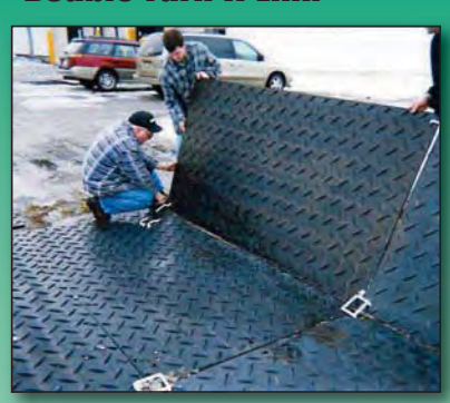
Steel links lock mats together to form a semi-permanent, yet portable, continuous roadway, walkway or working platform.