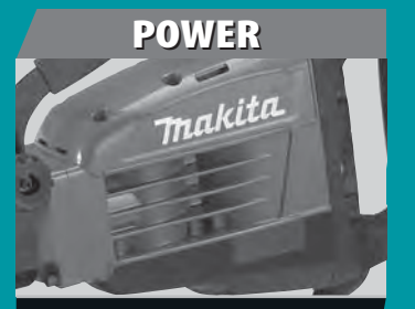
14 AMP motor; 730 - 1,450 BPM to tackle demanding jobs