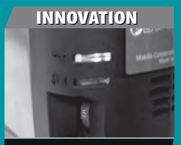
L.E.D. service/power lights indicate when brushes need to be replaced & of switch failure or cord damage