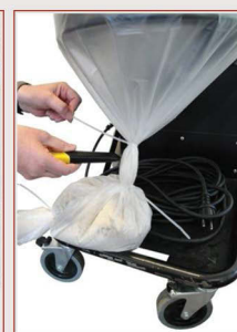
Cut between the ties.