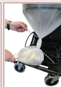
Attach two ties with a 5" gap