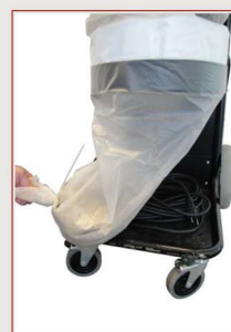
Pull the bag down.