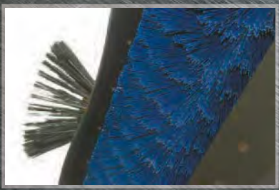
Replaceable bolt-on cutting edge and wafer package – Curb Sweeper optional.