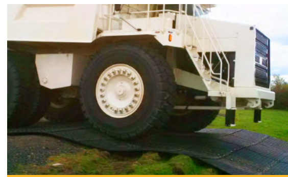
Tough enough to support heavy loads, machinery and tanks