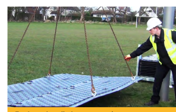
For faster installation mats can be joined in fours and lifted into place