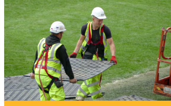
Easy to move

♠ PROP 65 WARNING: This product can expose you to chemicals including Carbon Black, which is known to the State of California to cause cancer and birth defects or other reproductive harm. For more information go to www.P65Warnings.ca.gov.