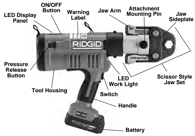
Figure 1 - RP 340 Press Tool and Jaw Set

The entire cycle duration is approximately five (5) seconds. Once the cycle begins to deform a fitting, it will automatically continue until completion, even if the trigger switch is released. The LED displays on the top of the tool indicate problems such as improper temperature, open jaw mounting pin or maintenance required.