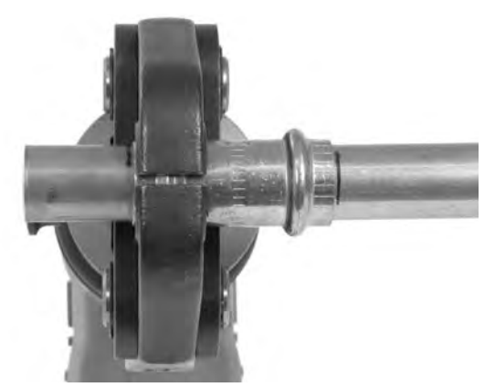
Figure 7 - RP 340 Tool Square To Tubing