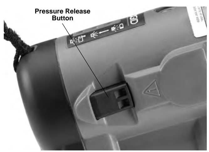
Figure 10 - Pressure Release Button