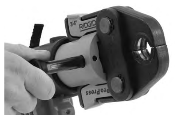
Figure 4 – Fully Open Attachment Mounting Pin