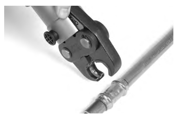
Figure 6 - Opening The Scissor-Style Jaw Set