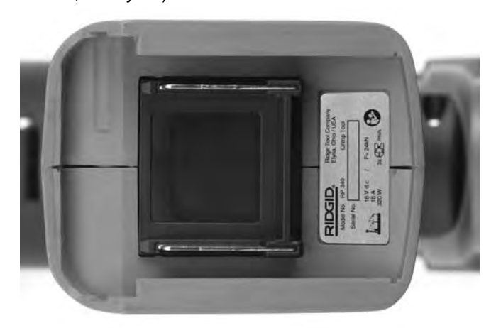
Figure 2 - Press Tool Serial Label

NOTE! RIDGID jaw sets are offered in two "series"