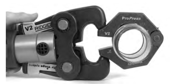
Figure 9 - Attaching Actuator to Press Ring

3. After cycle is complete, squeeze actuator arms to open and separate actuator from press ring. Remove the press ring from fitting by manually grasping ring halves and opening assembly. Avoid any sharp edges which may have formed on fitting during pressing operation.