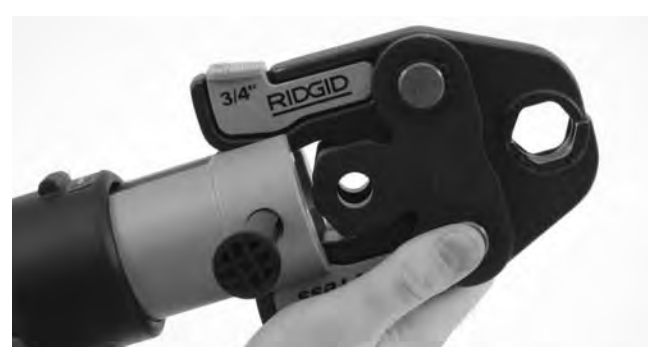
Figure 5 - Slide Attachment Into Tool