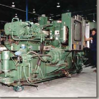
Count the money saved by doing the job yourself!