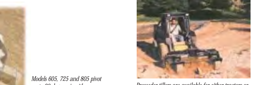
Preseeder tillers are available for either tractors or skid steer loaders. We'll help you pick the Preseeder tiller model that's right for your application.

Stones and debris are raked into convenient windrows. A shallow rotor setting removes stones from the seedbed while eliminating unwanted soil from windrows.