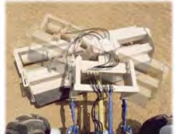
Models 605, 725 and 805 pivol up to 20 degrees in either direction for added versatility.