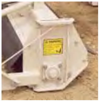
Replaceable skid shoes The skid shoes take a lot of abrasive wear and tear. That's why we make them from hardened steel. Models 605, 725 and 805 feature bolt-on replacements.