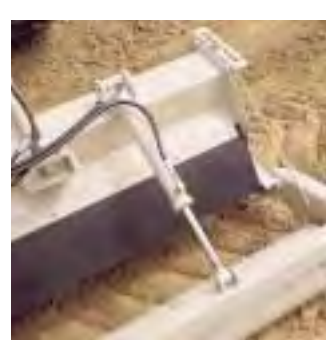
Instant depth control You can adjust the tiller depth right from the tractor seat. Plus, the exclusive built-in depth gauge gives you a handy visual depth indication.