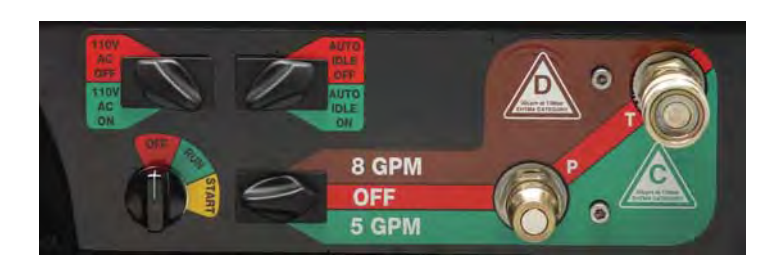
Figure 1. Panel Control Valve

The recommended hose length is 25 ft/8 m with a 1/2 inch/12.7 mm inside diameter. The hoses must have a working pressure rating of at least 2500 psi/175 bar. Each hose end must have male thread ends compatible with HTMA (HYDRAULIC TOOL MANUFACTURERS ASSOCIATION) quick disconnect fittings (NPT type threads). (See Figure 2.)