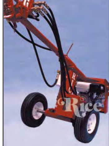
Self Propelled Model Forward & Reverse Drive

and neutralized weight balance, make the DIRT DAWG an awesome digging machine. Easy to maneuver from hole to