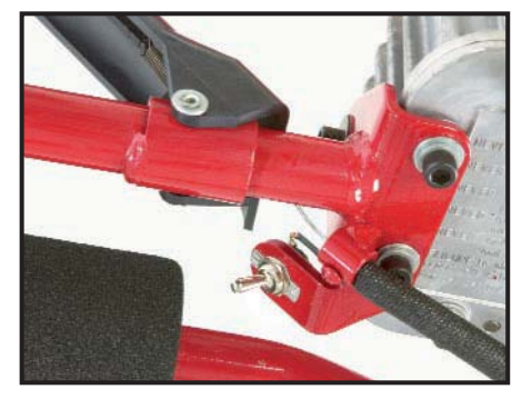
The engine throttle control and the on/off switch are conveniently located on the left handle. Padded handles are ergonomically designed for less fatiguing operation.