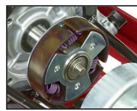
A reliable, centrifugal clutch slips when a buried object is encountered or the auger is overloaded. This protects the flexible drive cable and the transmission gears and shafts from damage.