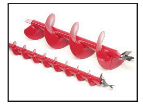
Little Beaver offers a complete line of snap-on augers in both 36" and 42" lengths. Diameters range from 1.5" to 16". We also offer snap-on extensions, in both full flighted and tube configurations.