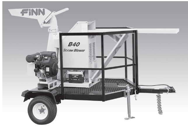
B40 Straw Blower Trailer Mounted (B40T)

As the world leader for over 70 years in the design and manufacture of innovative, quality equipment for the erosion control industry, FINN Corporation is committed to your complete satisfaction.