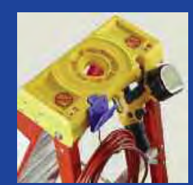
Take less trips up the ladder