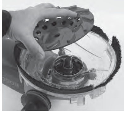
4. Install grinding wheel. (Use the washers provided to adjust wheel slightly below the brushes. You may also adjust the 3 screws if needed)