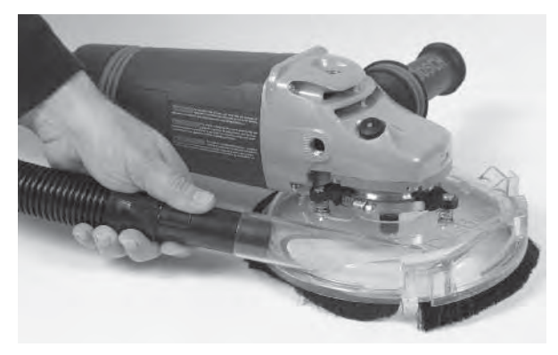
5. Insert hose to port. Secure other end of hose to the electric cord with releaseable tie provided. Go to www.dustlesstechnologies.com for more installation videos and tips

WARNING Always make sure grinder is UNPLUGGED when removing or attaching front nose clip. Before use, refer to your tool manual for warnings and instructions.