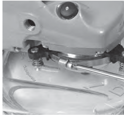
3. Center DustBuddie on the arbor and tighten band clamp.