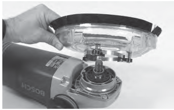
2. Slip around grinder's collar.