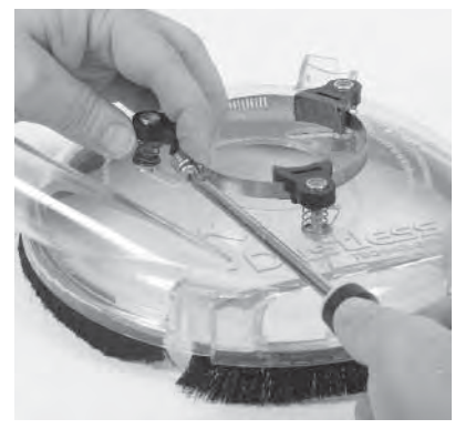
1. Loosen band clamp.