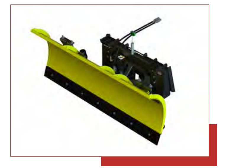
IMPORTANT: All replacement hydraulic hoses and fittings must have a minimum rated working pressure of 4000 psi. Hoses and hydraulic couplers from the attachment to the loader are included for skid-steer only.