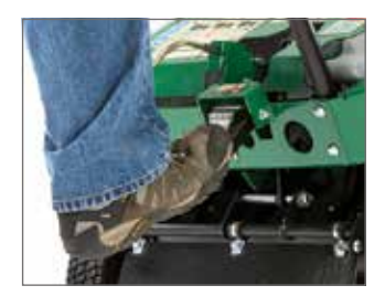
Patent Pending EZ Lift™ Rear Foot Pedal Conveniently lifts and locks tines for transport or when reversing.