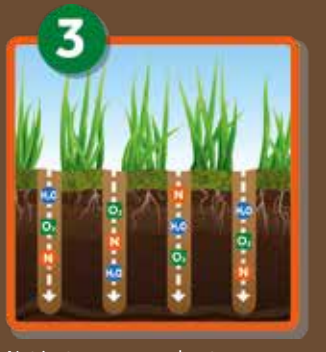
Nutrients, oxygen and water are now able to reach the root structure, creating a stronger lawn.