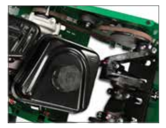
Cam-Driven Aerators Punches tine core depths to 7 cm \, even in hard soil conditions. Spring loaded rotor assist for aggressive forward motion of the tine rods.