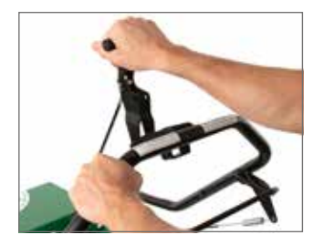
User Friendly Controls Handle has finger-tip controlled bail for engaging drive / tine with auto stop safety feature on PL18 Series.