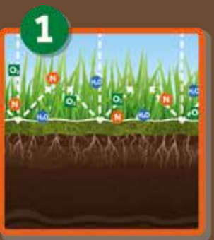
Due to compaction, oxygen, nutrients and water are difficult to infiltrate into the soil. This weakens the grass and depletes the root structure.

The Patent Pending EZ Drop™ tine system has a one-step tine engagement lever from the handle that quickly engages tines when the lever is depressed or disengages tines when the lever is released to pass over obstacles in the aeration path for uninterrupted aeration. It also features "in-ground" steering for unmatched maneuverability, ergonomics, ease of turning, improved production, reduced downtime and turf repair when compared to drum aerators.