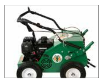
Easy Fold Handles ISO mounted folding handles help reduce vibration and offers fatigue free operation so you can complete more work in less time!