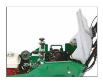
No Tool, Flip-Up Hood For best in class access to the inside of the machine for easy service plus improved belt access.