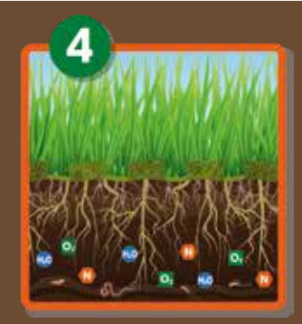
After treatment, the lawn will be lush and more resistant to diseases or droughts.