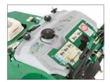
Water Weight Tank Positioned directly over tines for better aeration depth and wheel traction in drier conditions. Full tank capacity is 18 litres.