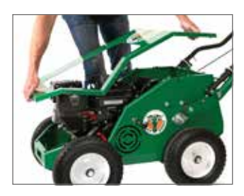
Removable Cover Quick and easy one piece hood removal for access to all components on PL18 Series.