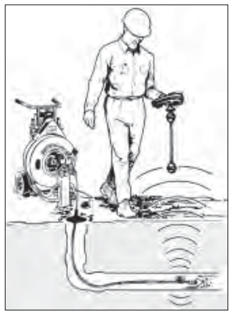
Scout and Remote Transmitter accurately locate problems in the line.

Ideal for users locating SeeSnakes and remote transmitters who occasionally need to trace an energized line.