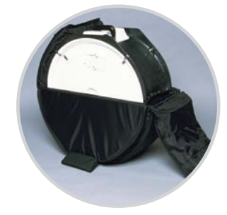
Fan cases Choose from two: a lightweight, heavy duty, water resistant nylon case or a nylon case padded with high density foam.