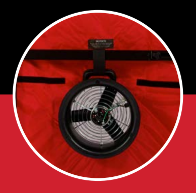
The Mini Fan Blower Door System uses the Duct Blaster fan and can be used to conduct blower door tests on small or tighter apartments and homes.