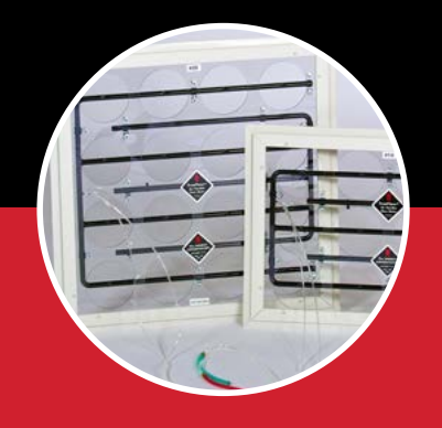
The TrueFlow® Air Handler Flow Meter is used to measure the total amount of air moving through an air handler.

For nearly 40 years, the Minneapolis Blower Door™ has been the system of choice for energy raters, HVAC contractors, builders, insulation contractors, weatherization professionals and utility programs.