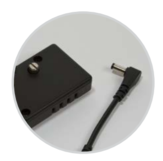
TEC WiFi Link Wireless connection to your laptop or mobile device using TEC WiFi Link.