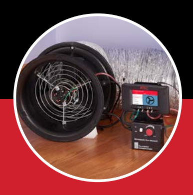
The Minneapolis Duct Blaster® is used to measure the airtightness of ductwork.