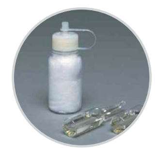
Smoke puffer A convenient source of a refillable, dense and persistent white smoke for diagnosing air leakage sites.