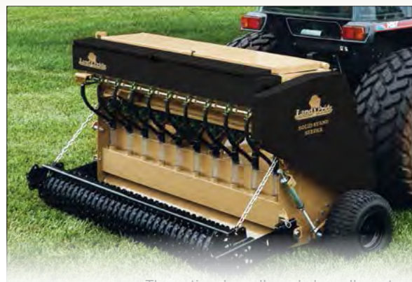
The optional small seeds box allows two seeds to be metered at one time into the