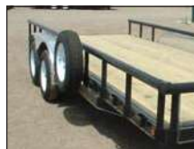
2" Pipetop Removeable Siderails