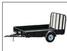
Regular Sides w/ Solid Metal