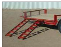
Side Mount ATV Ramps